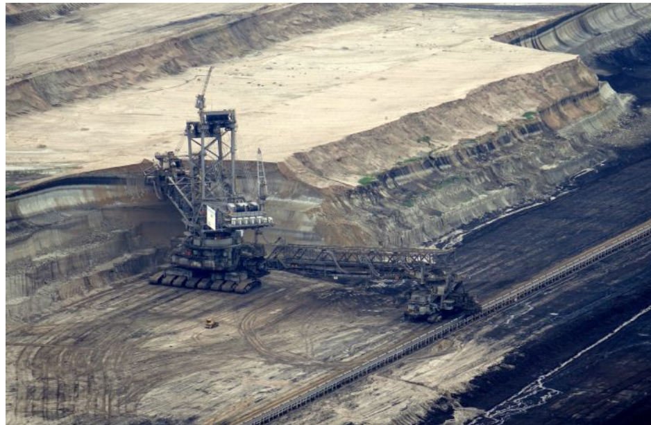
Open cast coal mine

By GREEN BUILDING AFRICA - NET CARBON ZERO BUILDINGS AND CITIES – January 29, 2019 No Comments