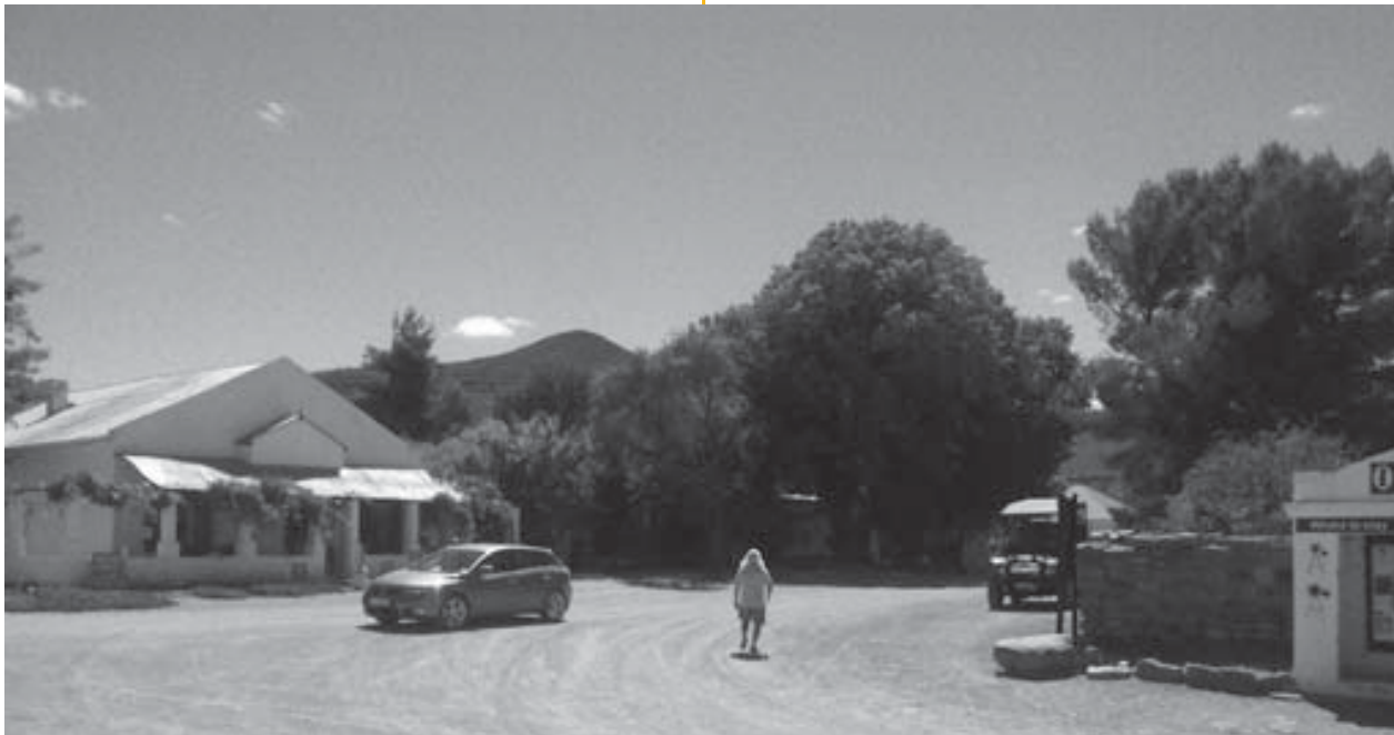
Small Karoo towns like Nieu Bethesda are under threat because of fracking.

This article was first published on Green24.com http://green.24.com/