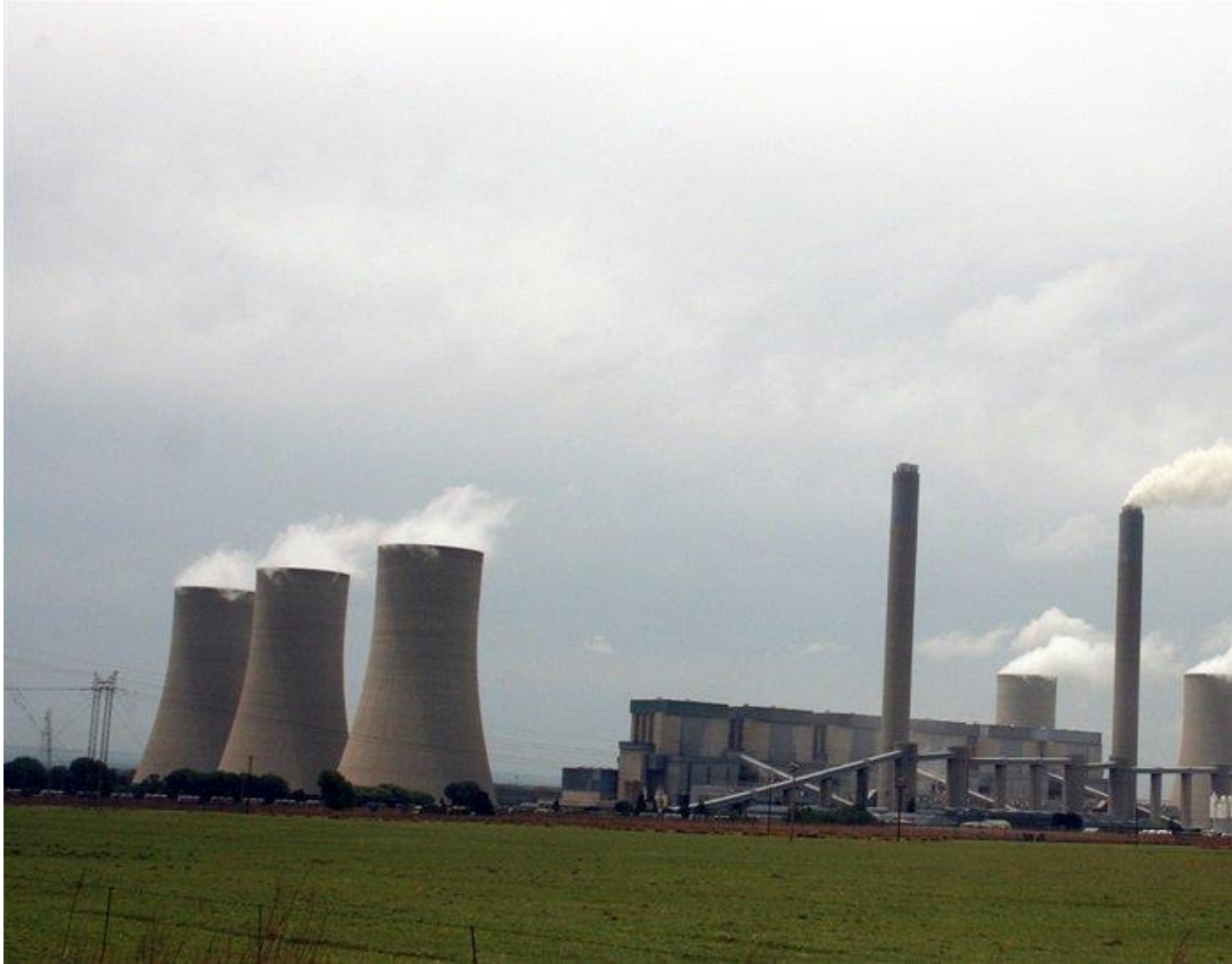
Eskom's Lethabo coal power station in the Vaal Triangle.