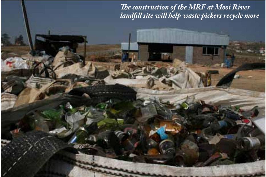
The construction of the MRF at Mooi River landfill site will help waste pickers recycle more

With the help of this guide, waste pickers can move towards becoming better organized in more formalized structures in the areas in which they work so that waste picking can continue to be a people-driven source of employment, boosting local economies and helping to curb pollution.