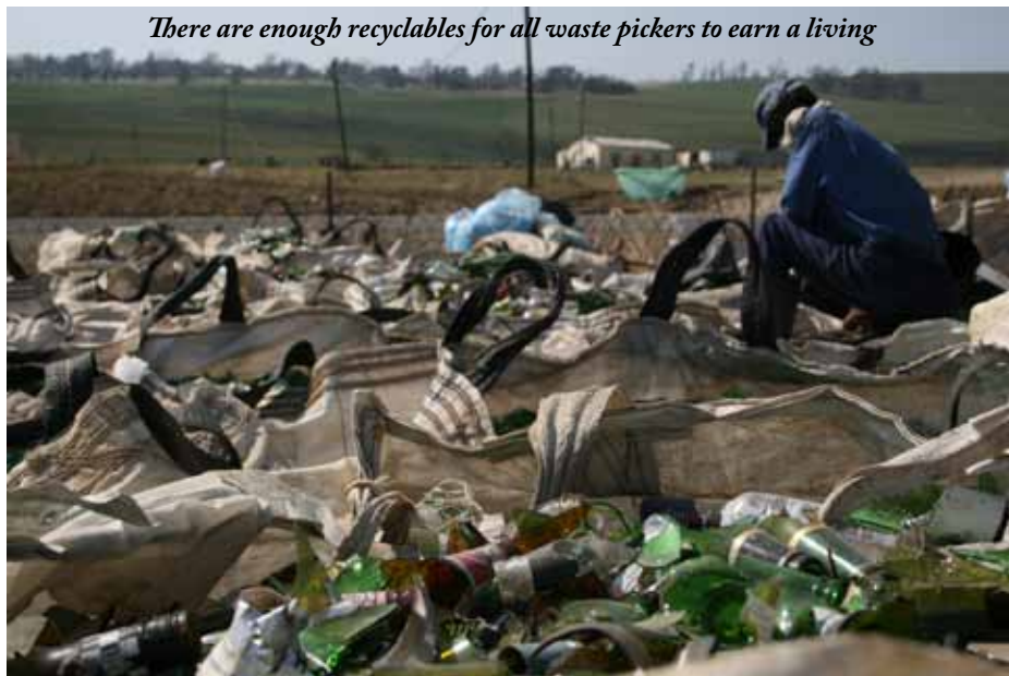
There are enough recyclables for all waste pickers to earn a living