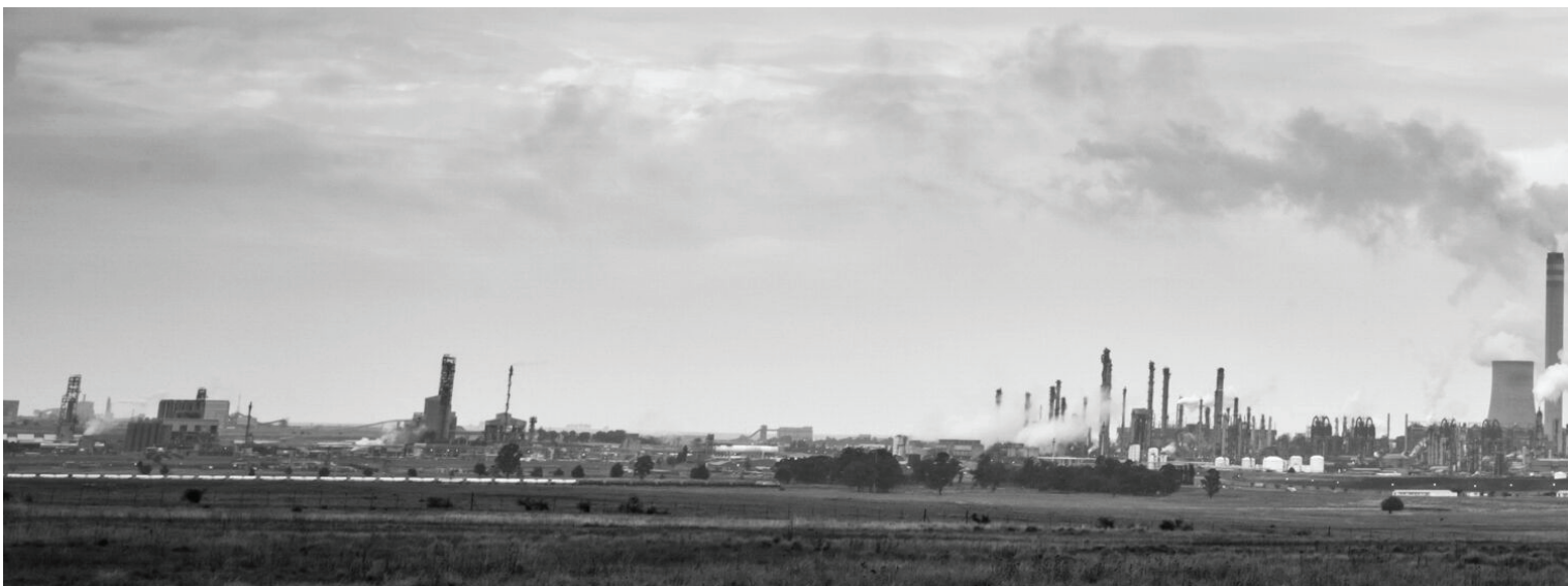
No wonder we find it hard to breathe!

Another thing in the constitution says that we have to always do what is best for every child. This means that the government and companies and people in South Africa have to always try to do what is best for children so that they can grow up strong, healthy and able.