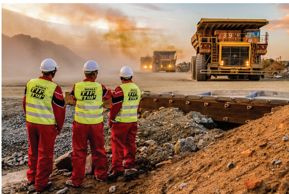
Uthuli oluvela emisebenzini yezimayini Umthombo omkhulu wokungcola komoya, ikakhulukazi Udaba lwezinhlayiyana esilukhulumile kumojula yokuqala.